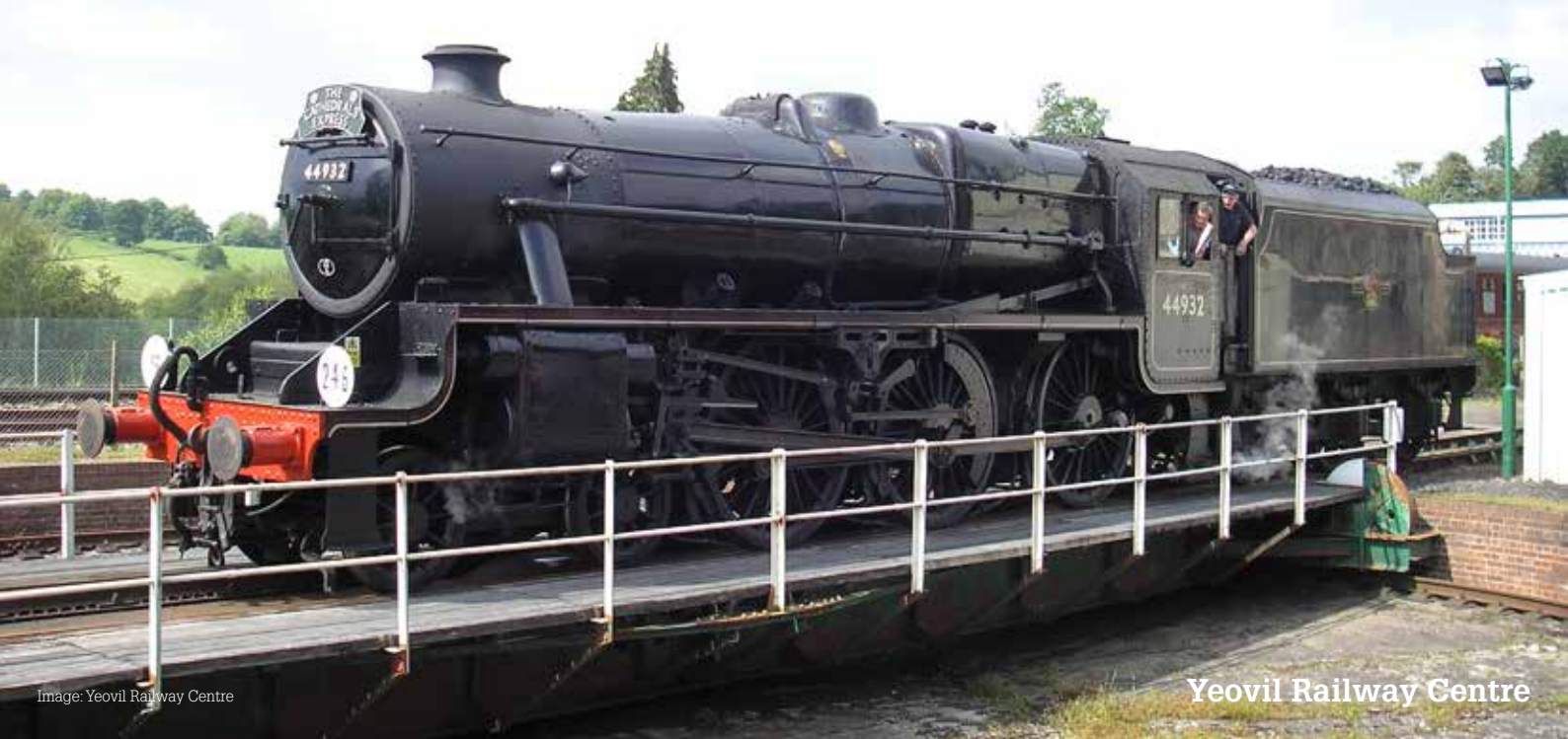
Image: Yeovil Railway Centre