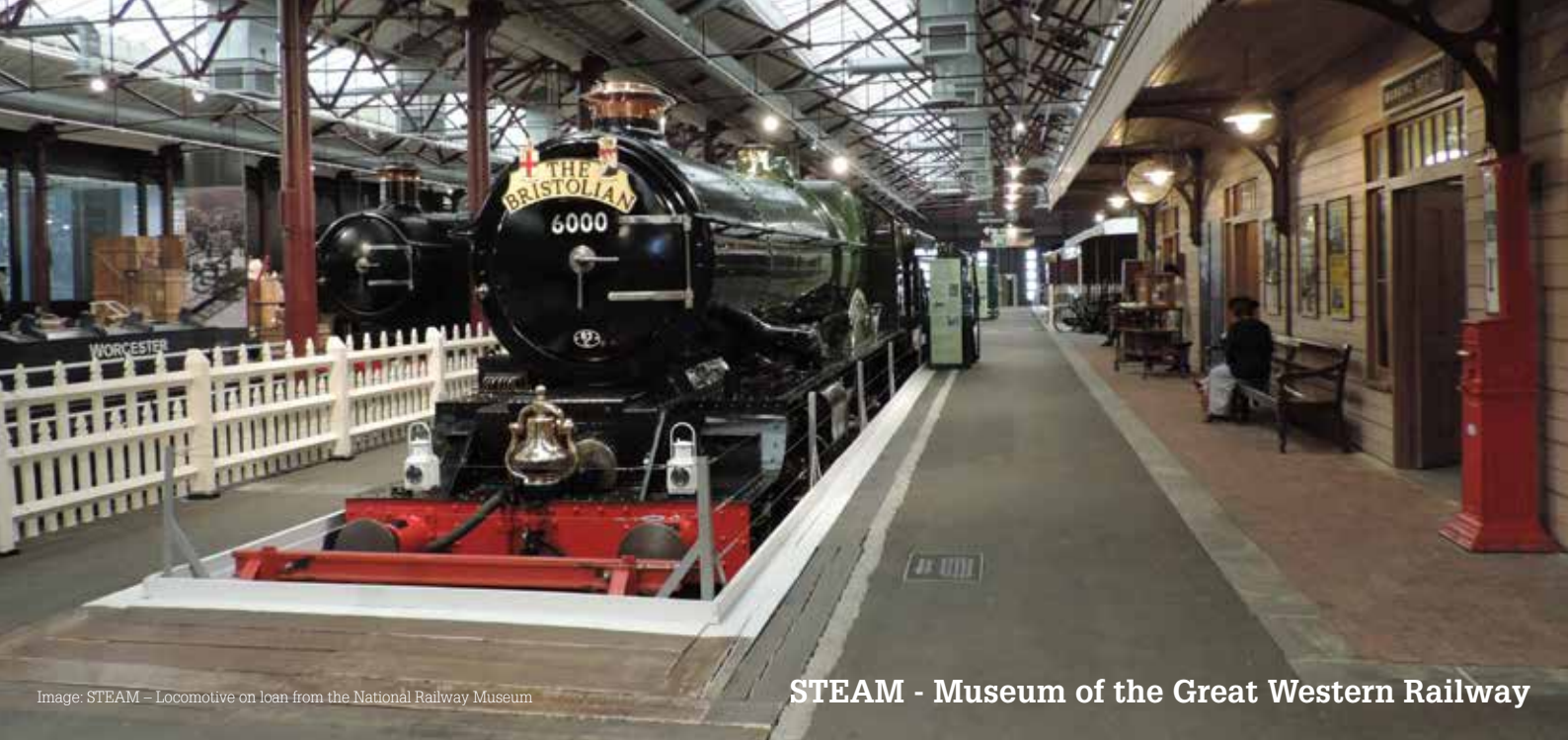
Image: STEAM – Locomotive on loan from the National Railway Museum

STEAM - Museum of the Great Western Railway